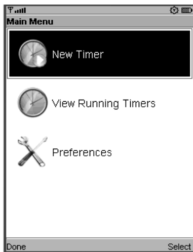
Figure 2. Main menu of application produced by designer B.